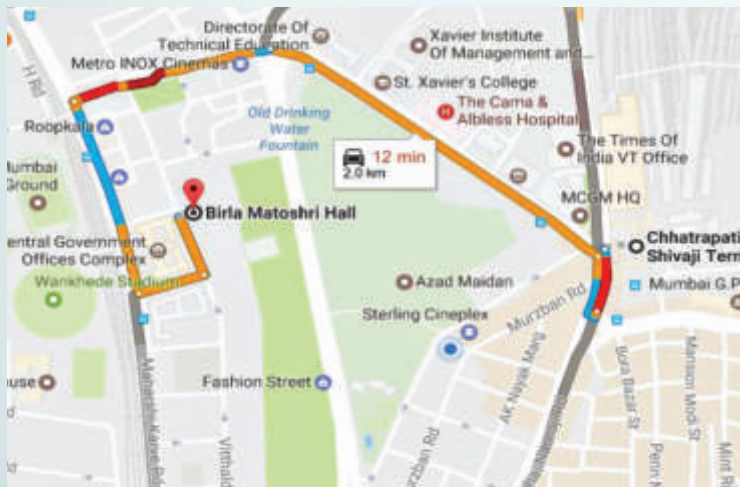
Distance from Chhatrapati Shivaji Terminus: 2 km

Date & Time : Friday June 16, 2017 at 3.30 p.m.