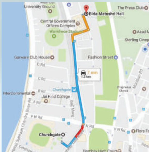
Distance from Churchgate Station: 1 km